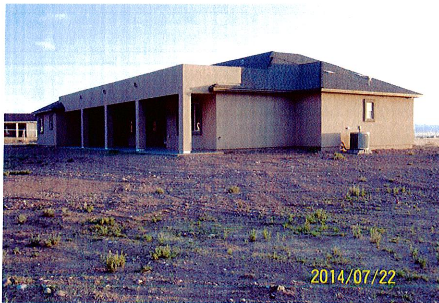
REAR OF HOME, FROM LEFT REAR CORNER