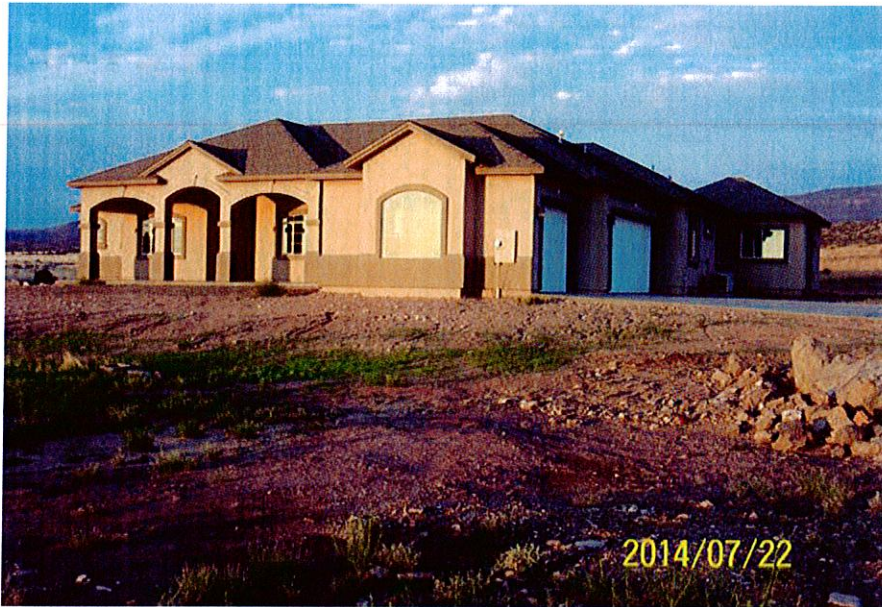
FRONT OF HOME, FROM FRONT RIGHT CORNER

If using the Elevation Certificate to obtain NFIP flood insurance, affix at least 2 building photographs below according to the instructions for Item A6. Identify all photographs with date taken; "Front View" and "Rear View"; and, if required, "Right Side View" and "Left Side View." When applicable, photographs must show the foundation with representative examples of the flood openings or vents, as indicated in Section A8. If submitting more photographs than will fit on this page, use the Continuation Page.