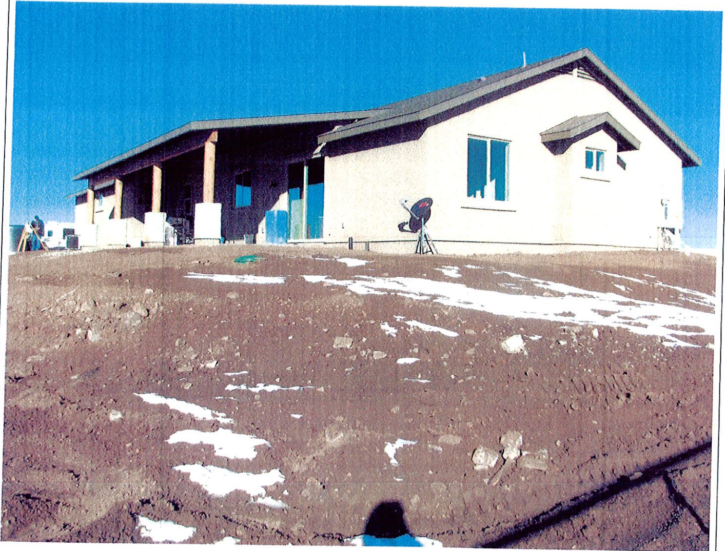
EAST END & SOUTH SIDE OF RESIDENCE – C2E AT AC UNIT SW COR. (BY SURVEYOR)

If using the Elevation Certificate to obtain NFIP flood insurance, affix at least 2 building photographs below according to the instructions for Item A6. Identify all photographs with date taken; "Front View" and "Rear View"; and, if required, "Right Side View" and "Left Side View." When applicable, photographs must show the foundation with representative examples of the flood openings or vents, as indicated in Section A8. If submitting more photographs than will fit on this page, use the Continuation Page.