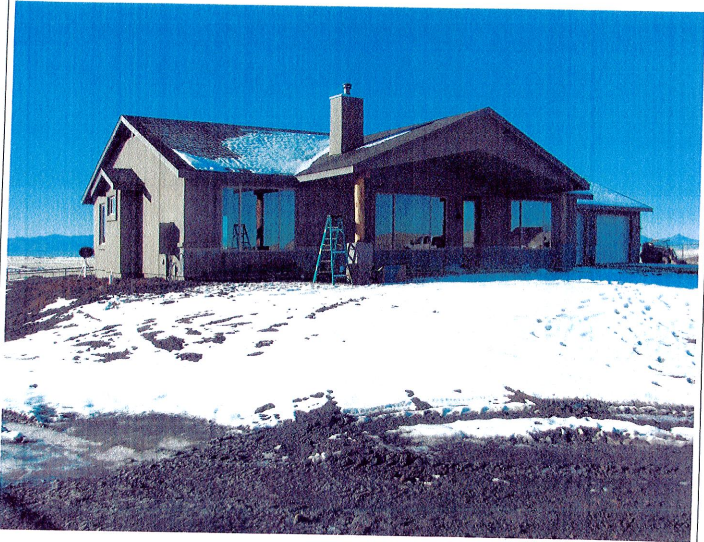
EAST END & NORTH SIDE OF RESIDENCE

If submitting more photographs than will fit on the preceding page, affix the additional photographs below. Identify all photographs with: date taken; "Front View" and "Rear View"; and, if required, "Right Side View" and "Left Side View." When applicable, photographs must show the foundation with representative examples of the flood openings or vents, as indicated in Section A8.