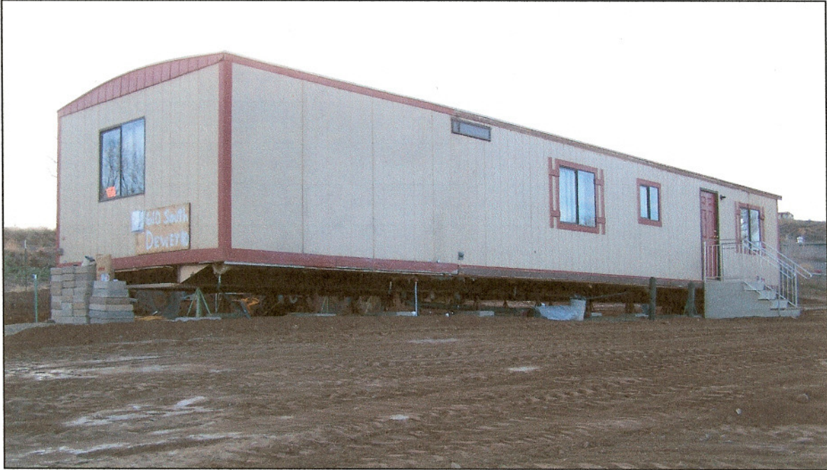
FRONT VIEW (from left front corner)

If using the Elevation Certificate to obtain NFIP flood insurance, affix at least two building photographs below according to the instructions for Item A6. Identify all photographs with: date taken; "Front View" and "Rear View"; and, if required, "Right Side View" and "Left Side View." If submitting more photographs than will fit on this page, use the Continuation Page on the reverse.