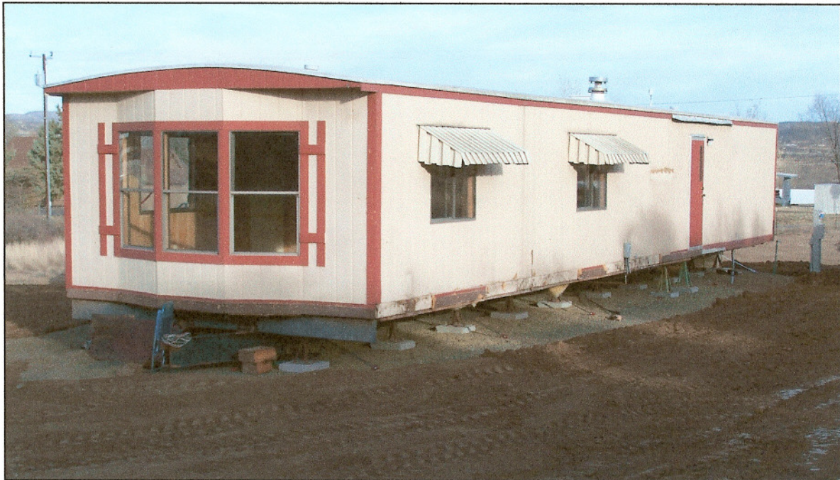
REAR VIEW (from right rear corner)