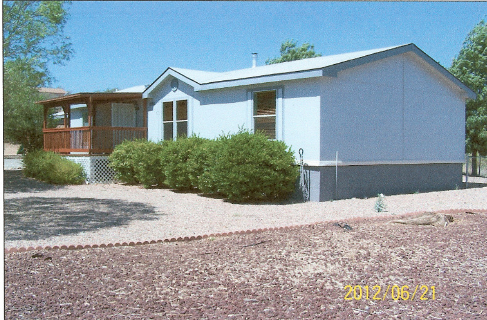
FRONT VIEW (from front right corner)

If using the Elevation Certificate to obtain NFIP flood insurance, affix at least two building photographs below according to the instructions for Item A6. Identify all photographs with: date taken; "Front View" and "Rear View"; and, if required, "Right Side View" and "Left Side View." If submitting more photographs than will fit on this page, use the Continuation Page on the reverse.