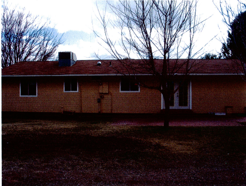
Rear View 2/14/2009

If submitting more photographs than will fit on the preceding page, affix the additional photographs below. Identify all photographs with: date taken; "Front View" and "Rear View"; and, if required, "Right Side View" and "Left Side View."