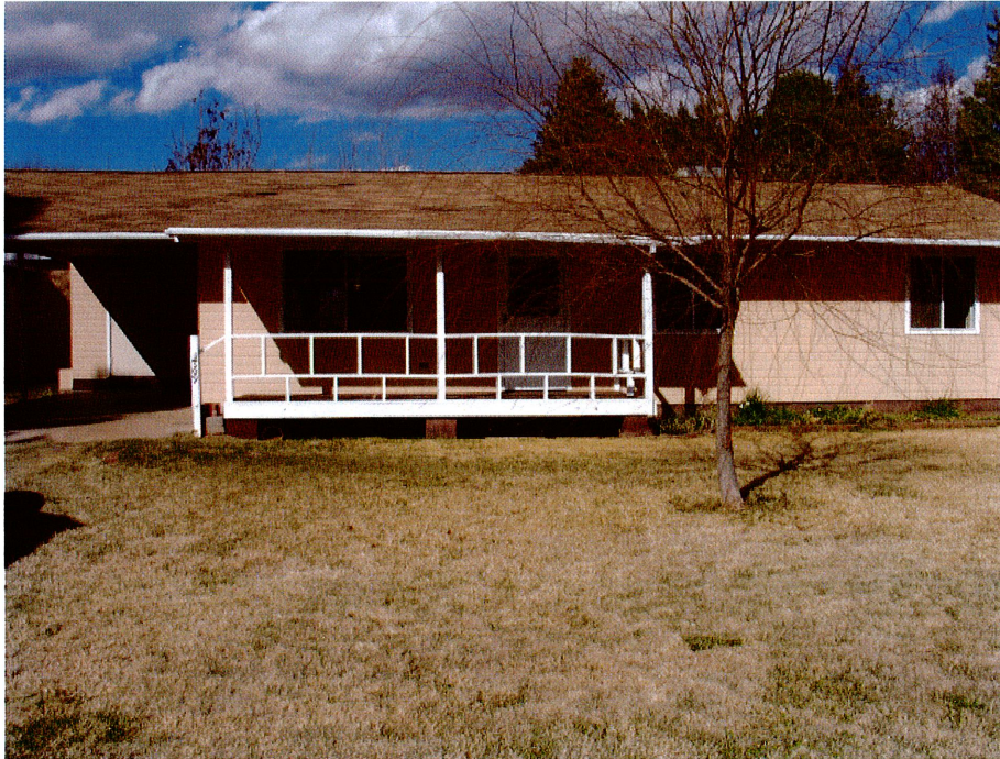
Front View 2/14/2009

If using the Elevation Certificate to obtain NFIP flood insurance, affix at least two building photographs below according to the instructions for Item A6. Identify all photographs with: date taken; "Front View" and "Rear View"; and, if required, "Right Side View" and "Left Side View." If submitting more photographs than will fit on this page, use the Continuation Page, following.