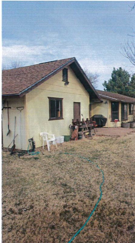
Rear view. East side of house

If submitting more photographs than will fit on the preceding page, affix the additional photographs below. Identify all photographs with: date taken; "Front View" and "Rear View"; and, if required, "Right Side View" and "Left Side View." When applicable, photographs must show the foundation with representative examples of the flood openings or vents, as indicated in Section A8.