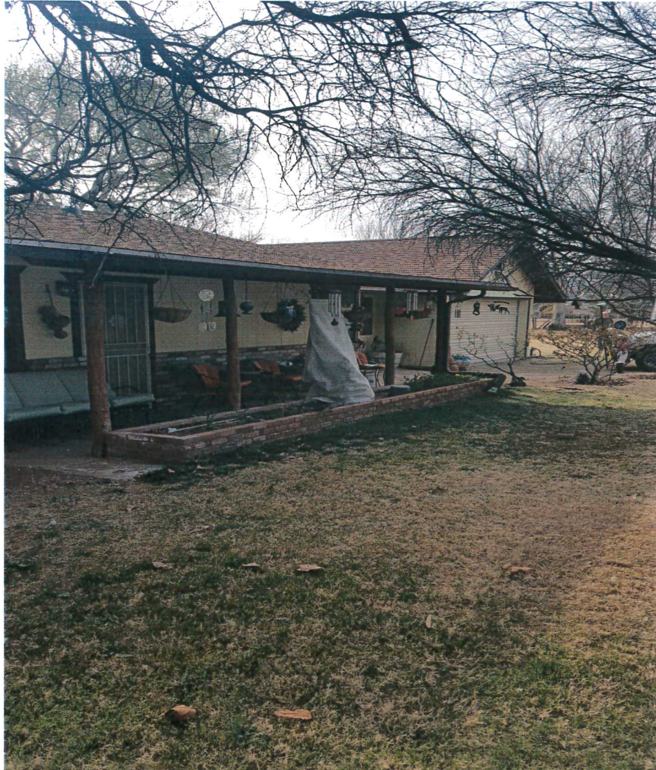
Front view, west side of house Front view. West side of house

If using the Elevation Certificate to obtain NFIP flood insurance, affix at least 2 building photographs below according to the instructions for Item A6. Identify all photographs with date taken; "Front View" and "Rear View"; and, if required, "Right Side View" and "Left Side View." When applicable, photographs must show the foundation with representative examples of the flood openings or vents, as indicated in Section A8. If submitting more photographs than will fit on this page, use the Continuation Page.