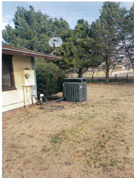
Rear view. Northeast corner of house. AC pad