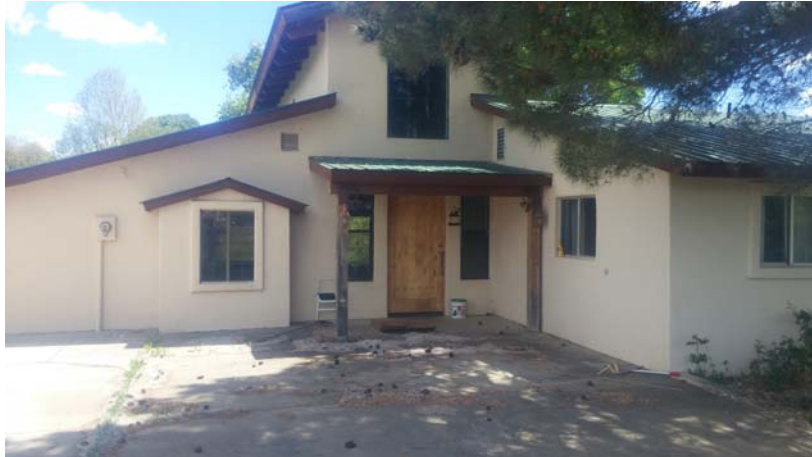
WEST ENTRY STREET