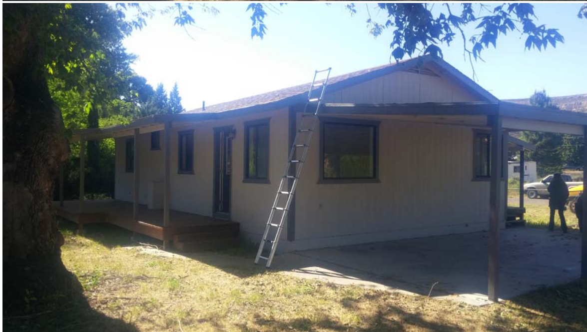
SO. EAST FACE