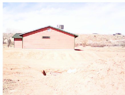
404-14-108B SIDE 1