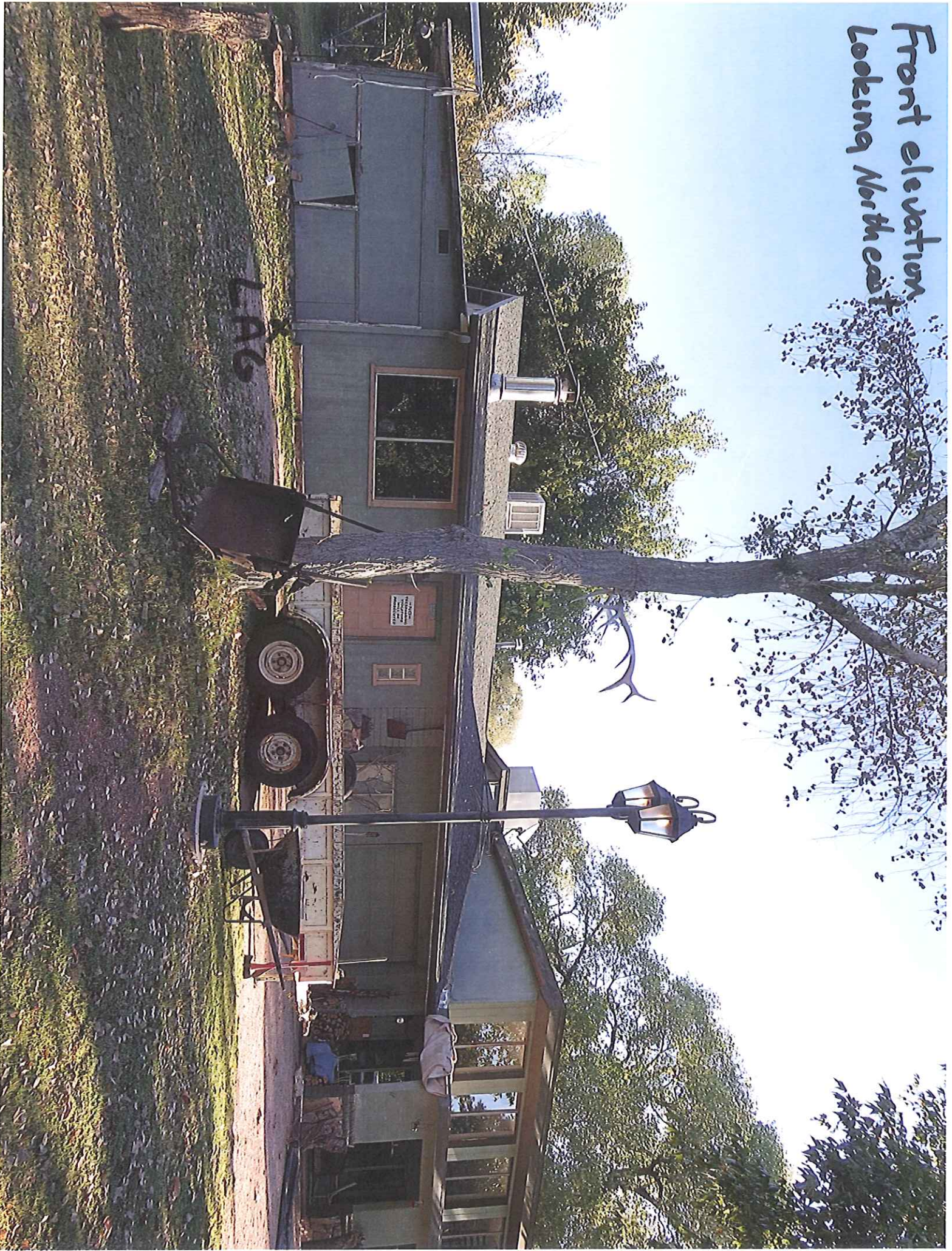
Front elevation Looking Northeast