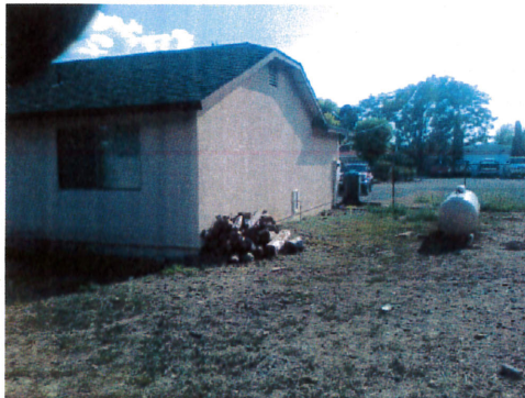
405-25-503A LEFT SIDE