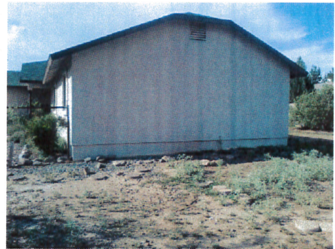
405-25-503A RIGHT SIDE