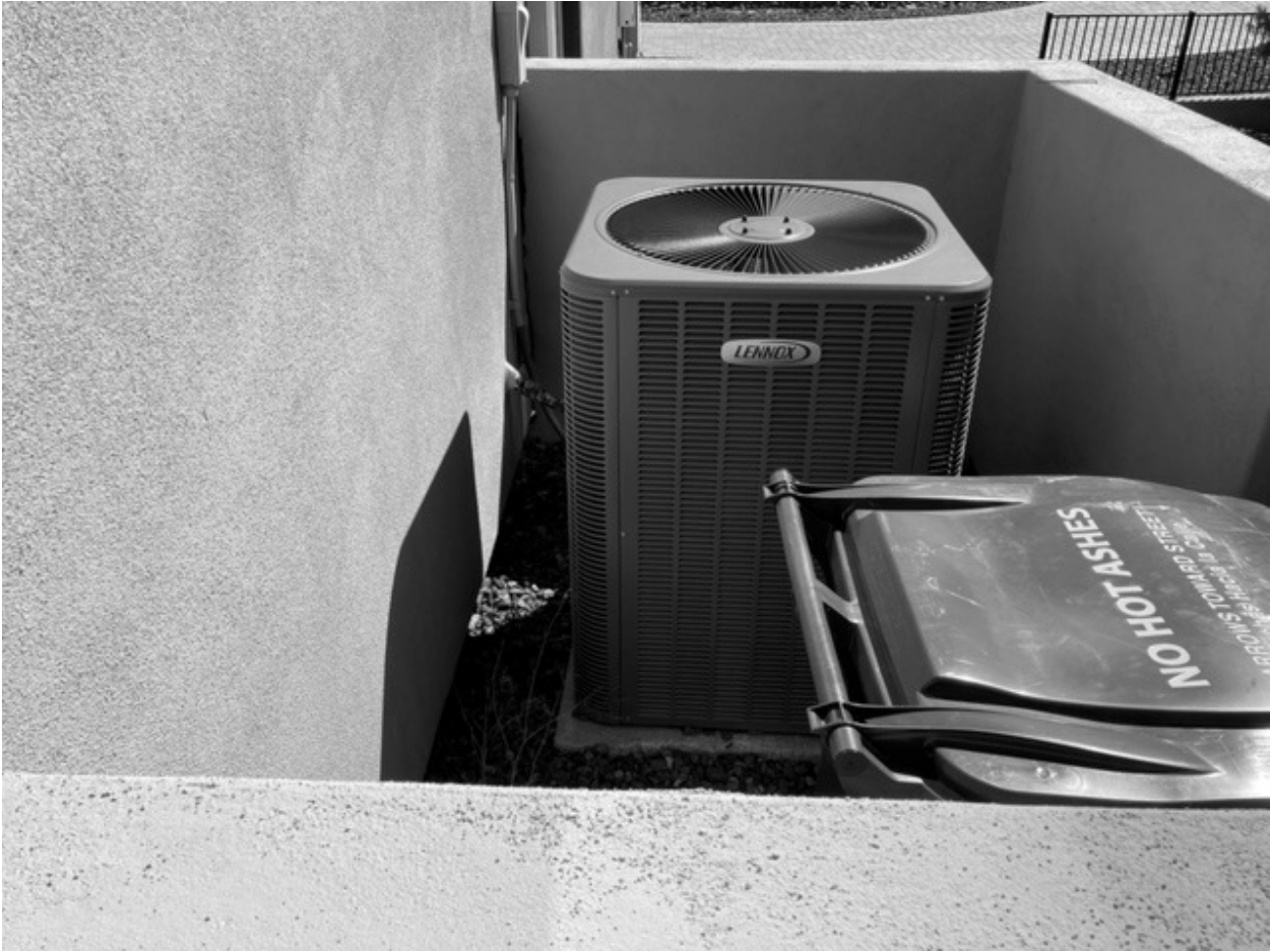
AC UNIT 230 PINION WOODS C2e: