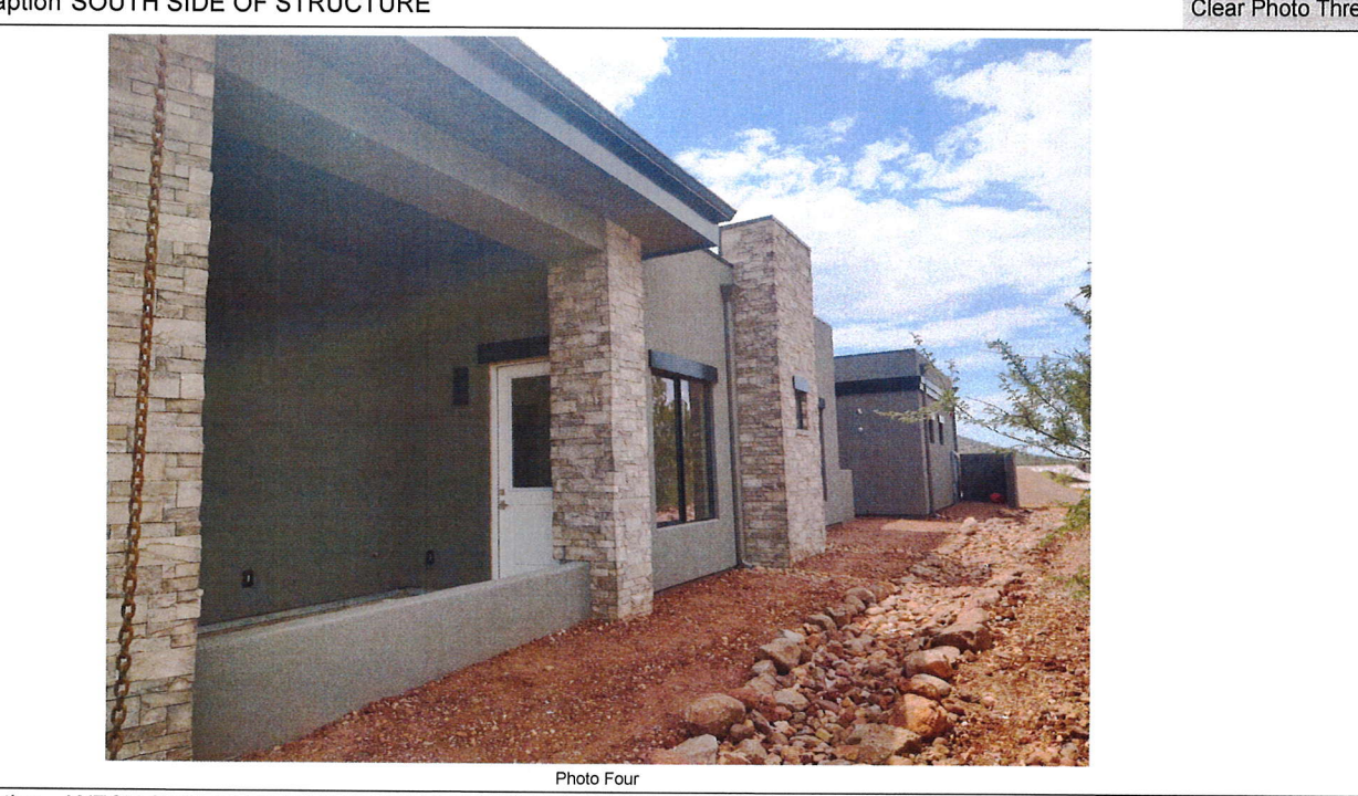
Photo Four Caption WEST SIDE OF STRUCTURE (A/C UNIT SHOWN IF PICTURE)