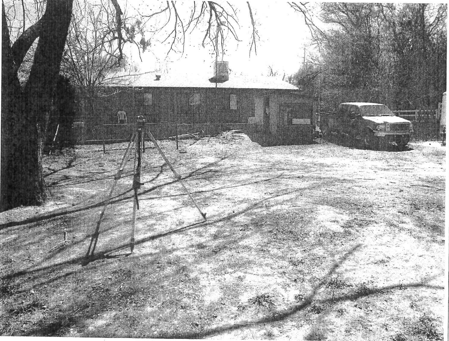
Back side of main building showing the pump house 03/28/2014

If using the Elevation Certificate to obtain NFIP flood insurance, affix at least 2 building photographs below according to the instructions for Item A6. Identify all photographs with date taken; "Front View" and "Rear View"; and, if required, "Right Side View" and "Left Side View." When applicable, photographs must show the foundation with representative examples of the flood openings or vents, as indicated in Section A8. If submitting more photographs than will fit on this page, use the Continuation Page.