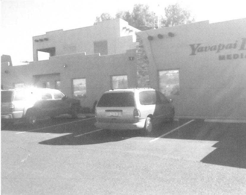
Front View 02-03-2011