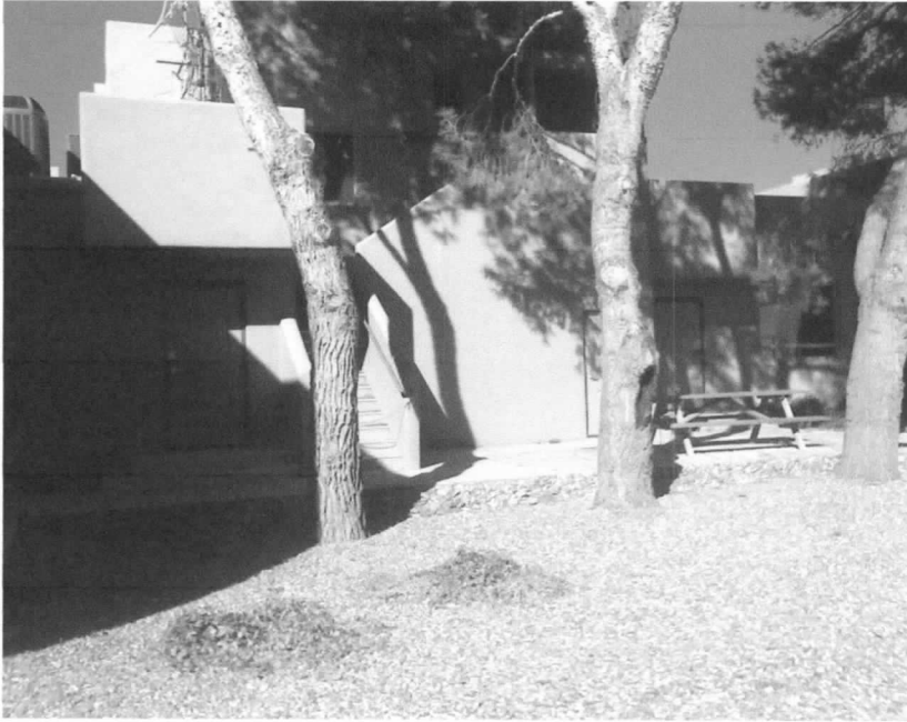
Back View 02-03-2011