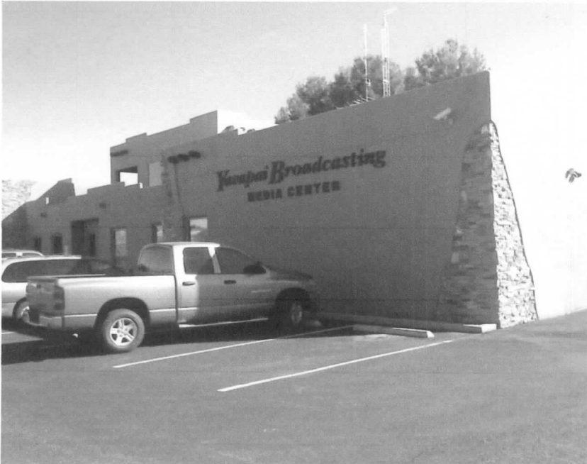
Front View 02-03-2011