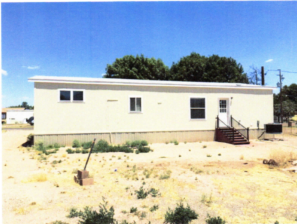
REAR VIEW 6/12/16

If using the Elevation Certificate to obtain NFIP flood insurance, affix at least 2 building photographs below according to the instructions for Item A6. Identify all photographs with date taken; "Front view" and "Rear view"; and, if required, "Right Side View" and "Left Side View." When applicable, photographs must show the foundation with representative examples of the flood openings or vents, as indicated in Section A8. If submitting more photographs than will fit on this page, use the Continuation Page.