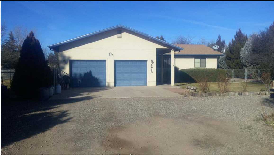
FRONT (SOUTH FACE)

If using the Elevation Certificate to obtain NFIP flood insurance, affix at least 2 building photographs below according to the instructions for Item A6. Identify all photographs with date taken; "Front View" and "Rear View"; and, if required, "Right Side View" and "Left Side View." When applicable, photographs must show the foundation with representative examples of the flood openings or vents, as indicated in Section A8. If submitting more photographs than will fit on this page, use the Continuation Page.