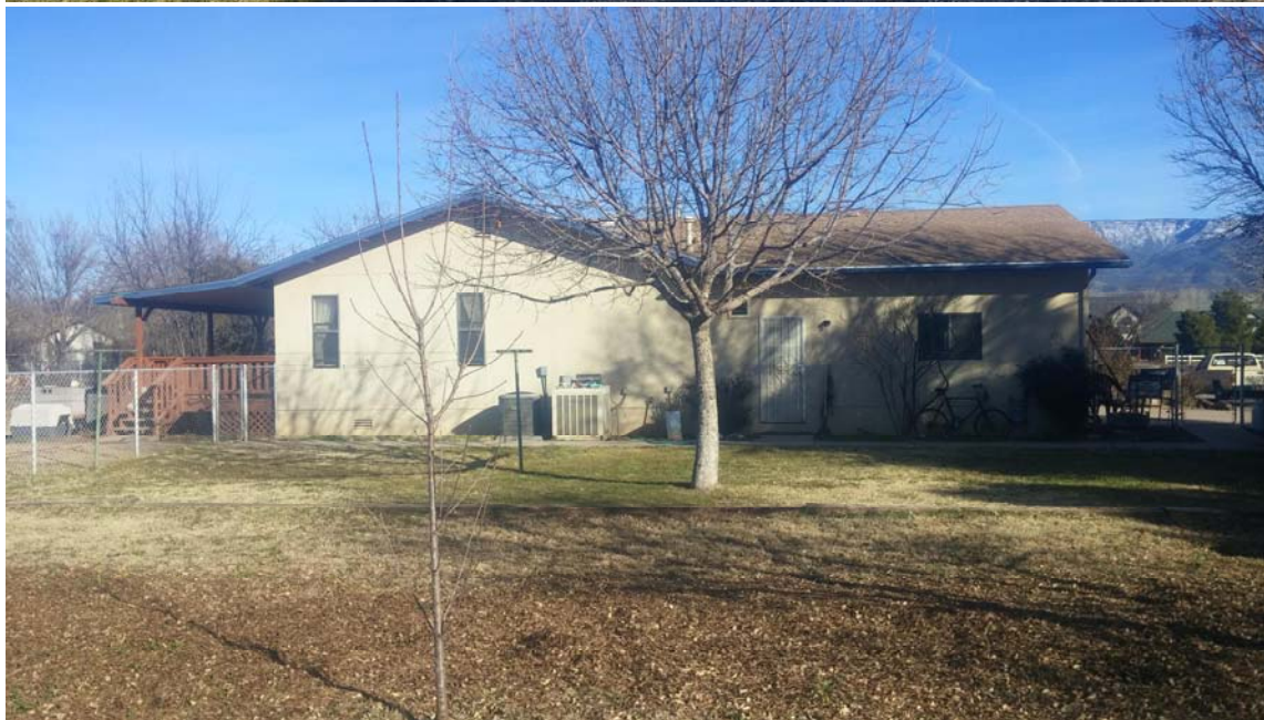
SIDE (EAST FACE)