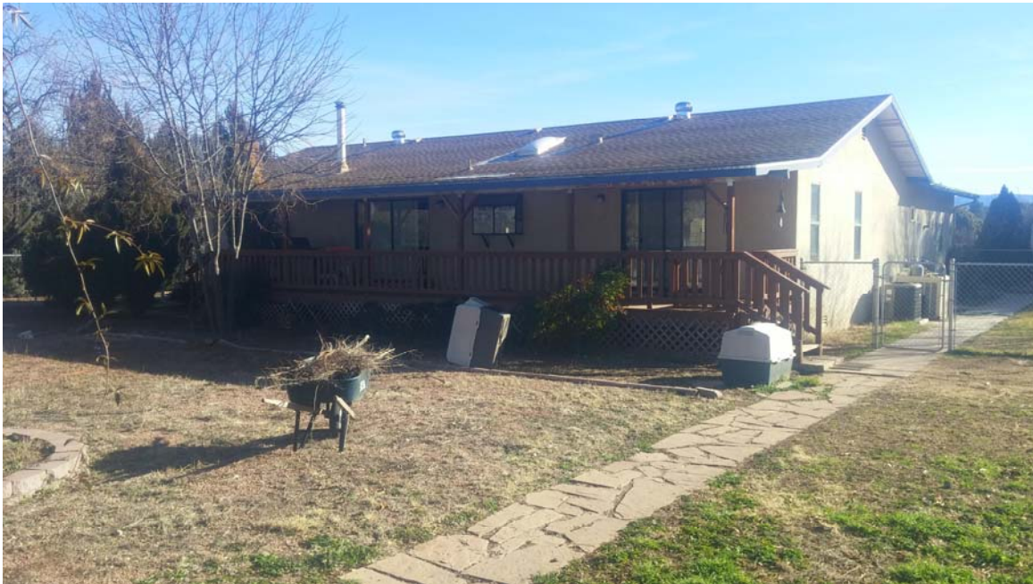
REAR (NORTH FACE)