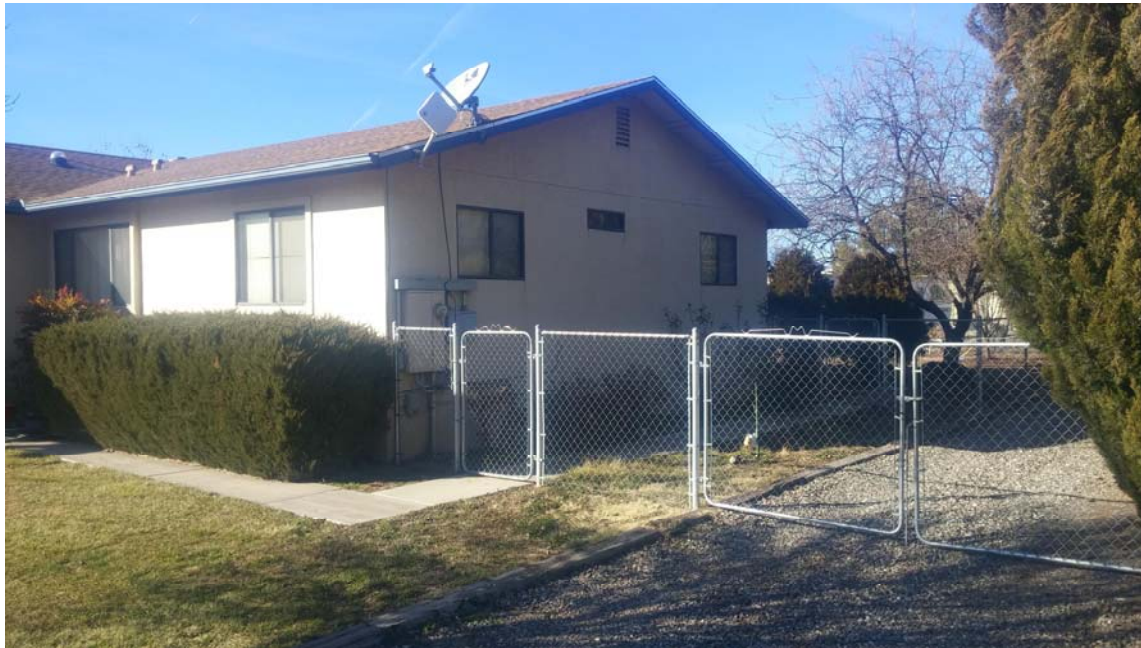
SIDE (WEST FACE)

If submitting more photographs than will fit on the preceding page, affix the additional photographs below. Identify all photographs with: date taken; "Front View" and "Rear View"; and, if required, "Right Side View" and "Left Side View." When applicable, photographs must show the foundation with representative examples of the flood openings or vents, as indicated in Section A8.