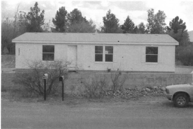
FRONT - FROM NORTH

ROBERT EDDINGFIELD 406-14-688J PHOTO DATE: 4-09-08