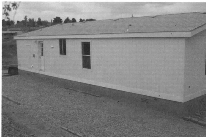
REAR - FROM SOUTH