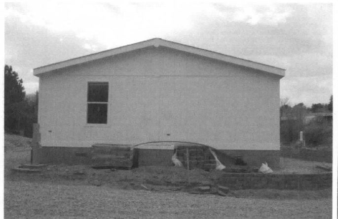
LEFT - FROM EAST