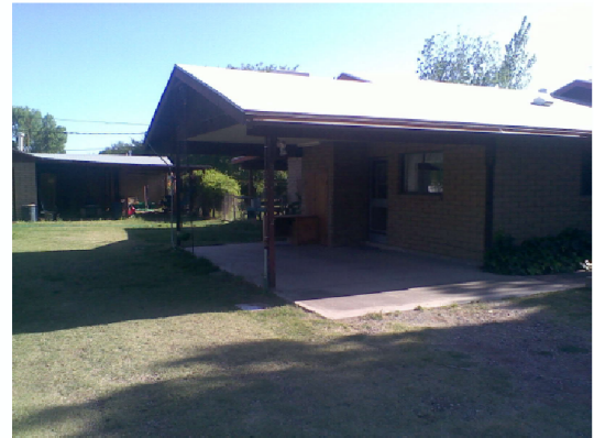
406-20-028 LEFT SIDE