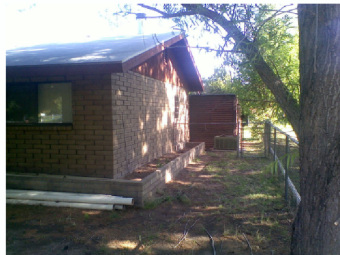
406-20-028 RIGHT SIDE