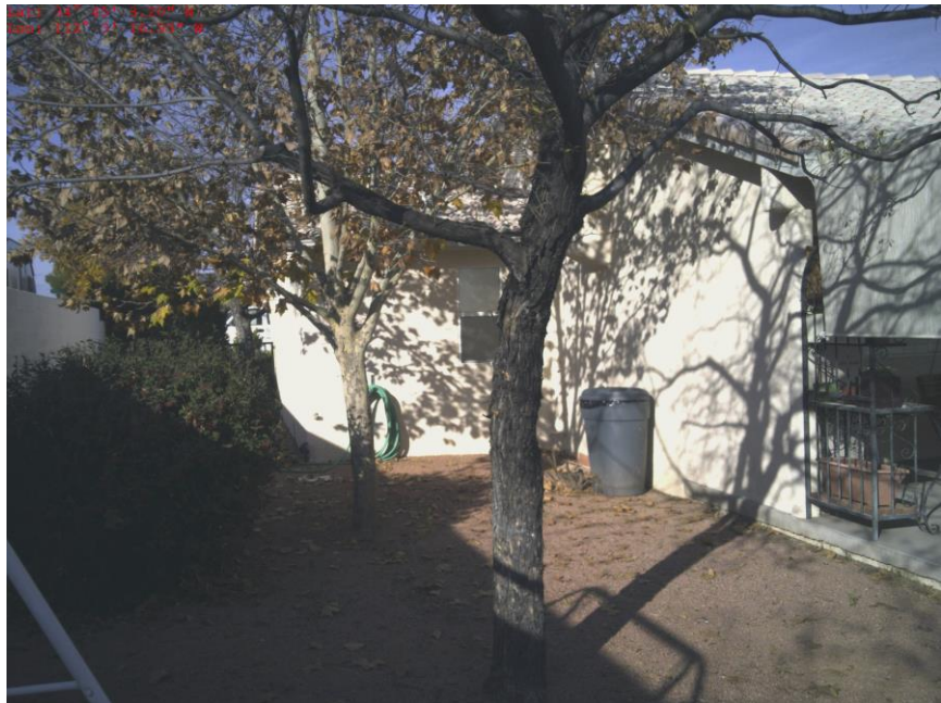
Right Side View 12/12/14