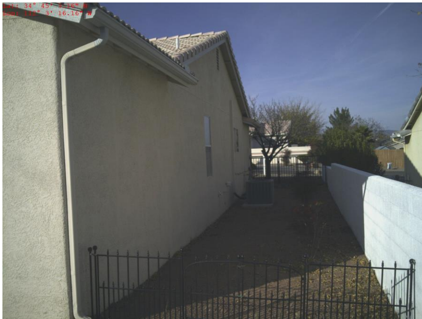
Left Side View 12/12/14