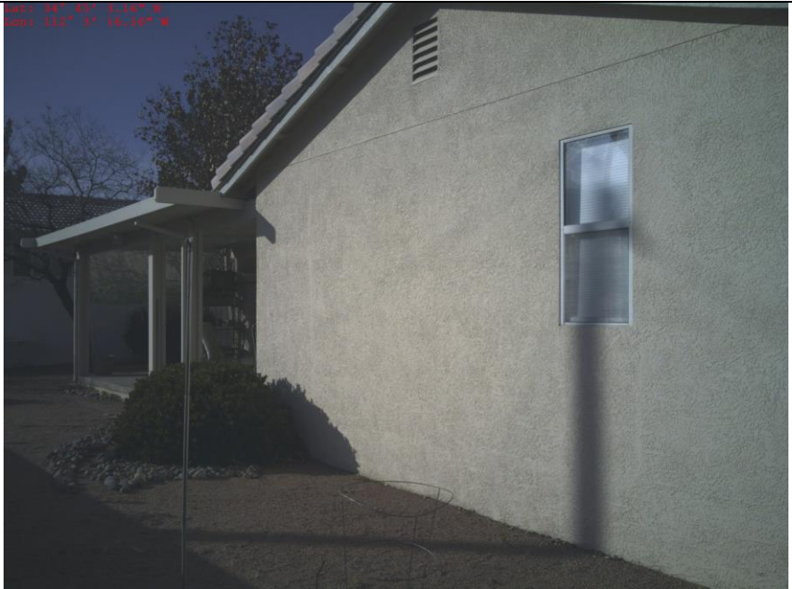
Rear View 12/12/14

If submitting more photographs than will fit on the preceding page, affix the additional photographs below. Identify all photographs with: date taken; "Front View" and "Rear View"; and, if required, "Right Side View" and "Left Side View." When applicable, photographs must show the foundation with representative examples of the flood openings or vents, as indicated in Section A8.