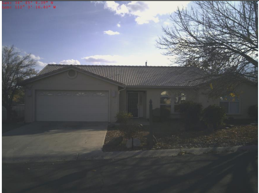
Front View 12/12/14

If using the Elevation Certificate to obtain NFIP flood insurance, affix at least 2 building photographs below according to the instructions for Item A6. Identify all photographs with date taken; "Front View" and "Rear View"; and, if required, "Right Side View" and "Left Side View." When applicable, photographs must show the foundation with representative examples of the flood openings or vents, as indicated in Section A8. If submitting more photographs than will fit on this page, use the Continuation Page.