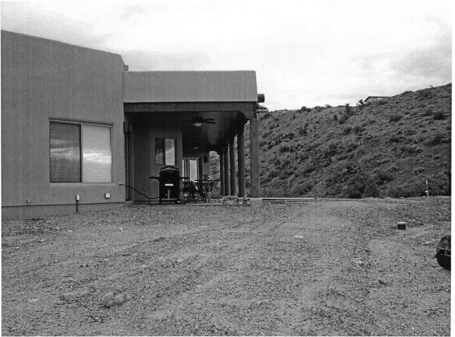
REAR VIEW 08/23/2006