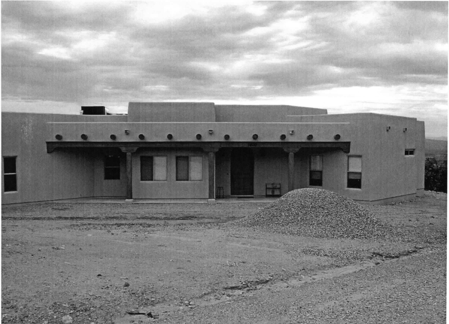
FRONT VIEW 08/23/2006