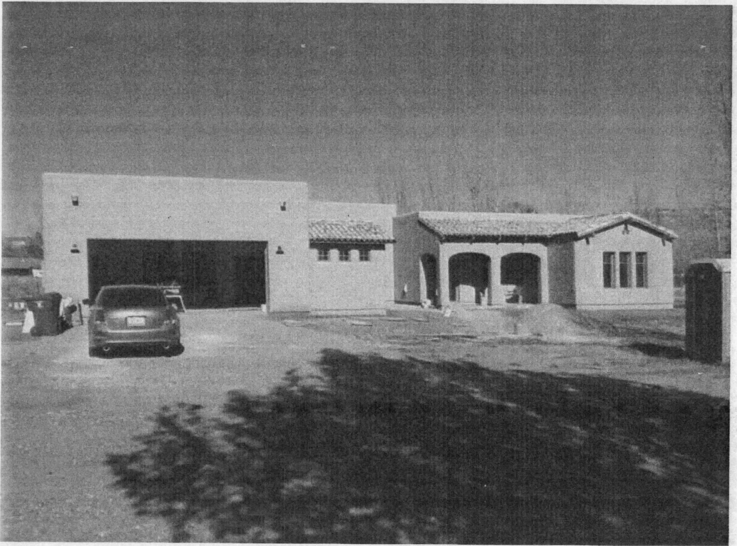
FRONT VIEW (TAKEN 11/02/2010)

If using the Elevation Certificate to obtain NFIP flood insurance, affix at least two building photographs below according to the instructions for Item A6. Identify all photographs with: date taken; "Front View" and "Rear View"; and, if required, "Right Side View" and "Left Side View." If submitting more photographs than will fit on this page, use the Continuation Page, following.