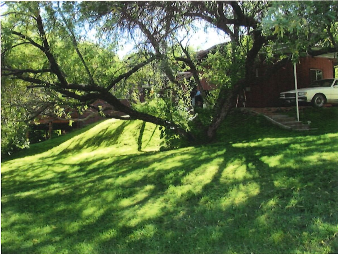
DWELLING A RIGHT SIDE FRONT VIEW PHOTO TAKEN 6/2/2008