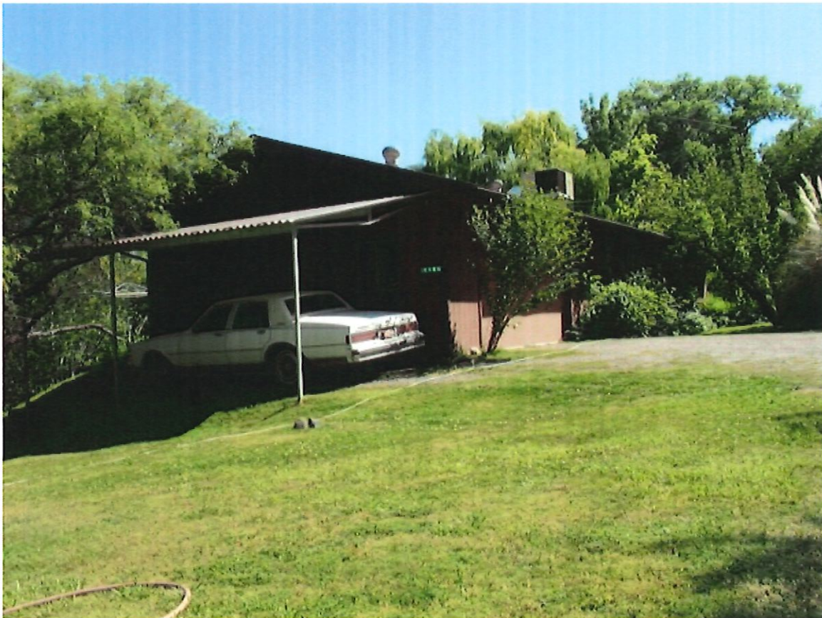
DWELLING A REAR VIEW PHOTO TAKEN 6/2/2008