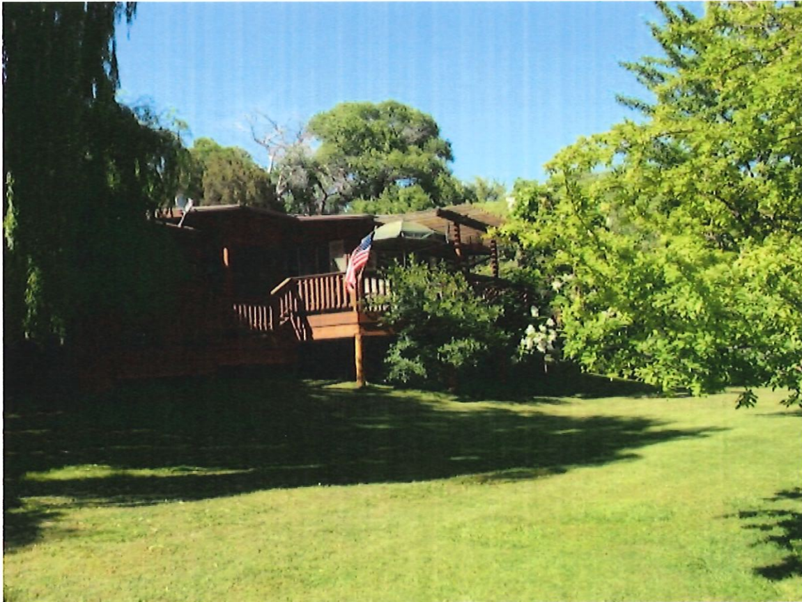
DWELLING A LEFT SIDE FRONT VIEW PHOTO TAKEN 6/2/2008