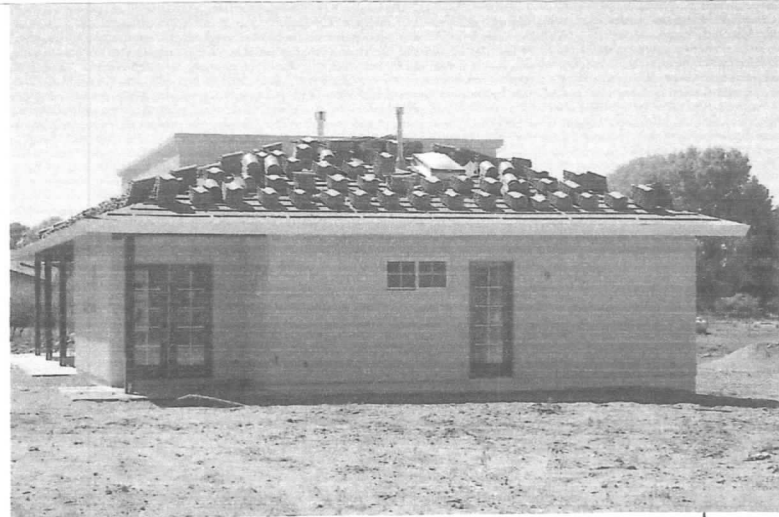
FRONT - FROM SOUTH