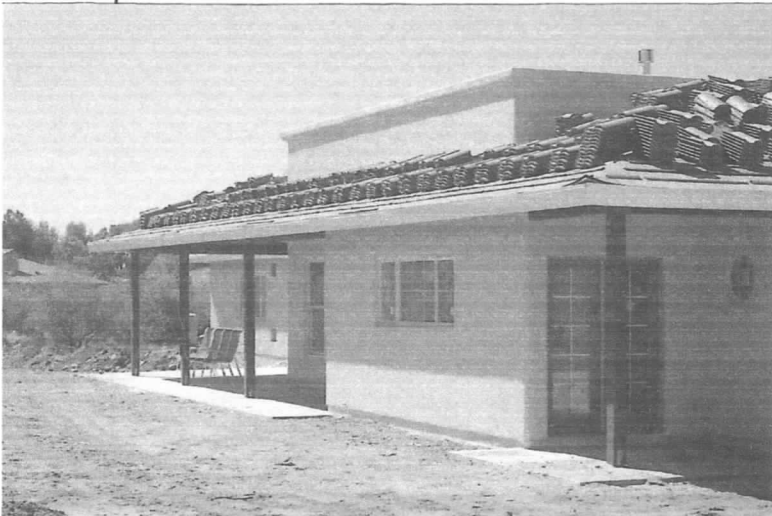
RIGHT - FROM EAST