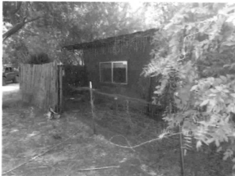
407-32-011 RIGHT SIDE