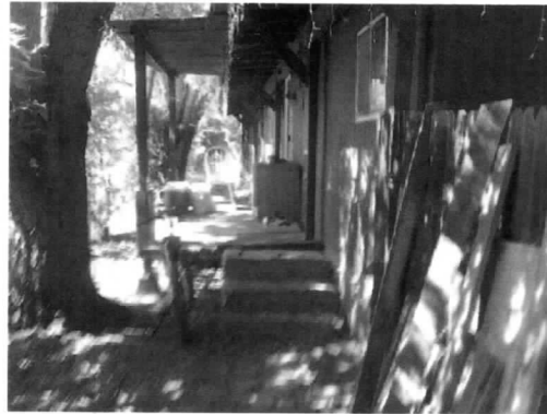
407-32-011 LEFT SIDE