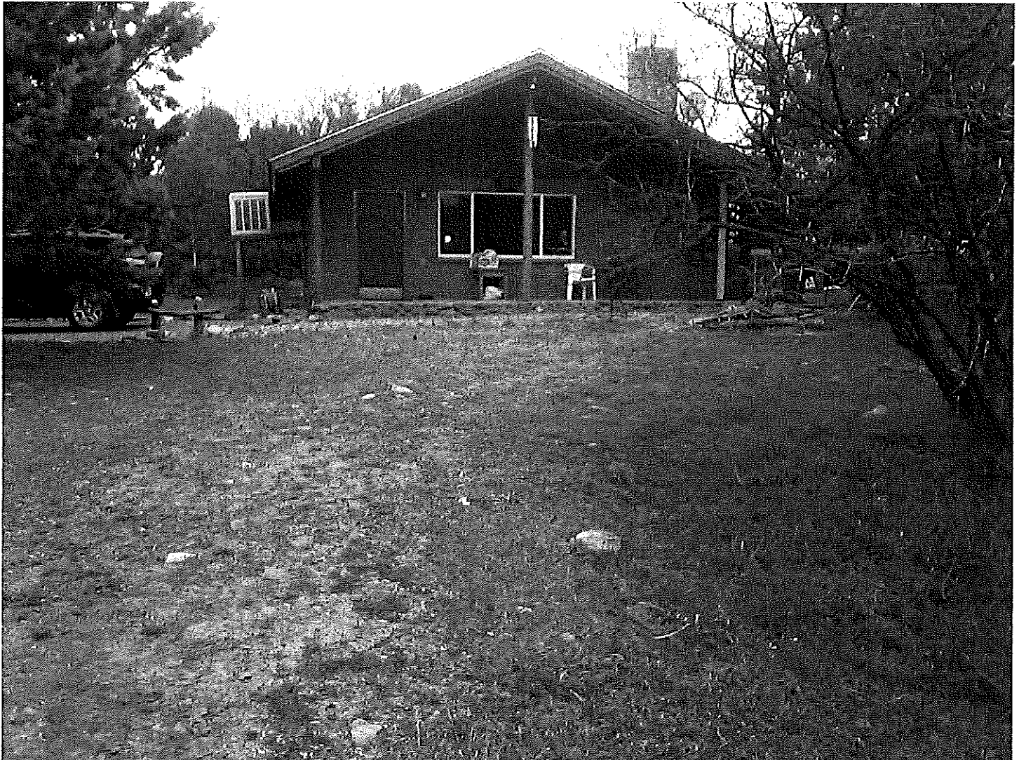
"Front View" camera looking Northwest.