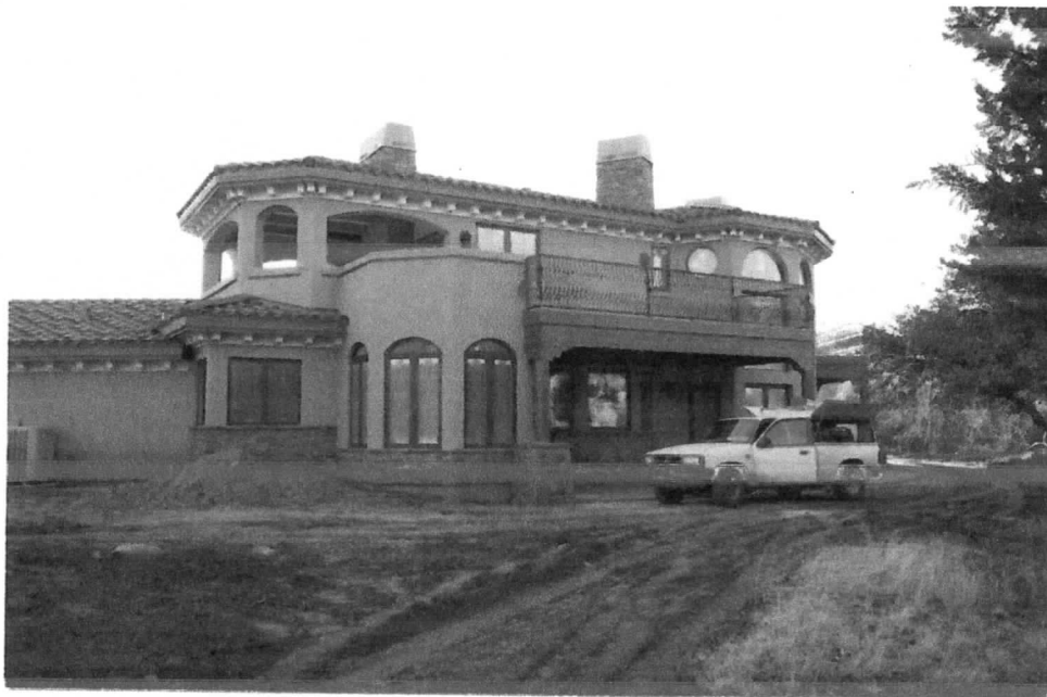
Rear View - East side

If submitting more photographs than will fit on the preceding page, affix the additional photographs below. Identify all photographs with: date taken; "Front View" and "Rear View"; and, if required, "Right Side View" and "Left Side View." When applicable, photographs must show the foundation with representative examples of the flood openings or vents, as indicated in Section A8.