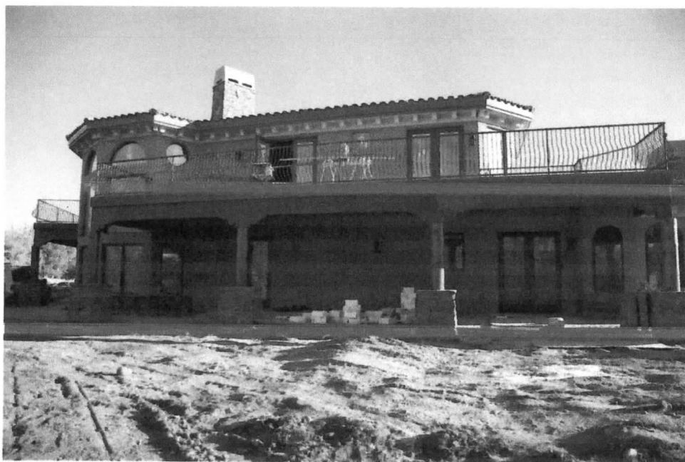
Rear View West side