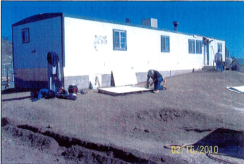
FRONT VIEW (from front left corner)

If using the Elevation Certificate to obtain NFIP flood insurance, affix at least two building photographs below according to the instructions for Item A6. Identify all photographs with: date taken; "Front View" and "Rear View"; and, if required, "Right Side View" and "Left Side View." If submitting more photographs than will fit on this page, use the Continuation Page on the reverse.