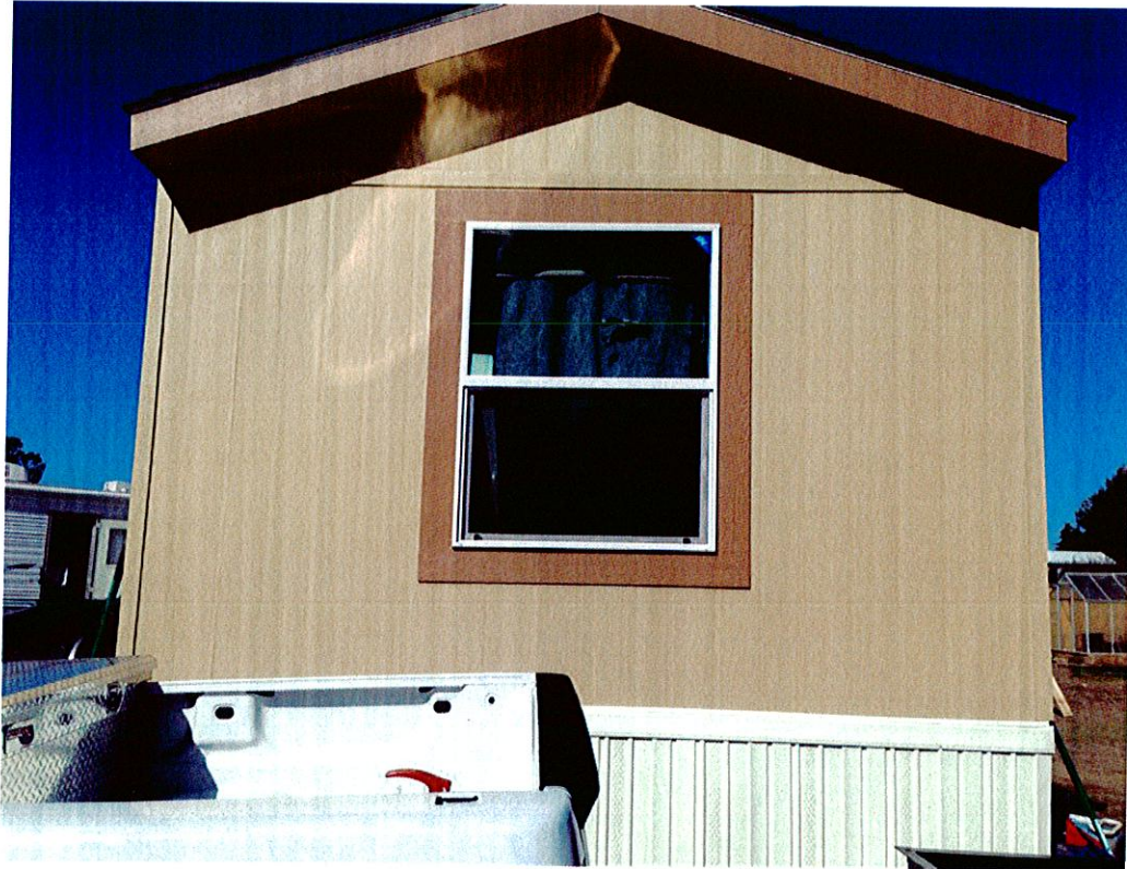
SIDE VIEW 03/08/2015

If submitting more photographs than will fit on the preceding page, affix the additional photographs below. Identify all photographs with: date taken; "Front View" and "Rear View"; and, if required, "Right Side View" and "Left Side View." When applicable, photographs must show the foundation with representative examples of the flood openings or vents, as indicated in Section A8.