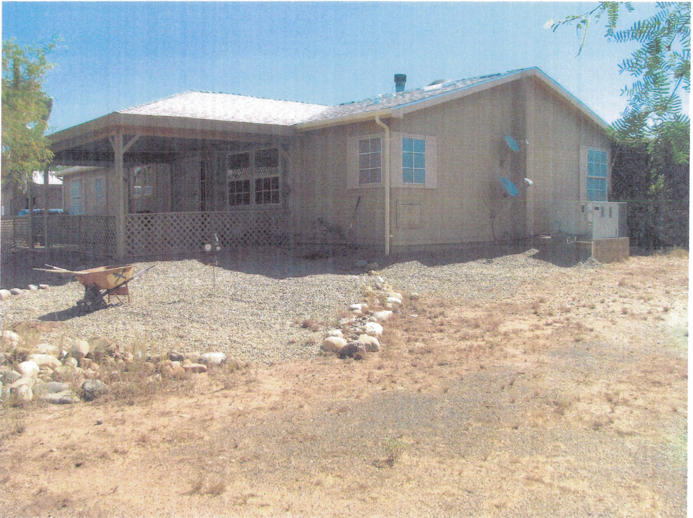
SOUTH END/WEST SIDE - C2E ON A/C PAD 06-27-2016

If using the Elevation Certificate to obtain NFIP flood insurance, affix at least 2 building photographs below according to the instructions for Item A6. Identify all photographs with date taken; "Front View" and "Rear View"; and, if required, "Right Side View" and "Left Side View." When applicable, photographs must show the foundation with representative examples of the flood openings or vents, as indicated in Section A8. If submitting more photographs than will fit on this page, use the Continuation Page.