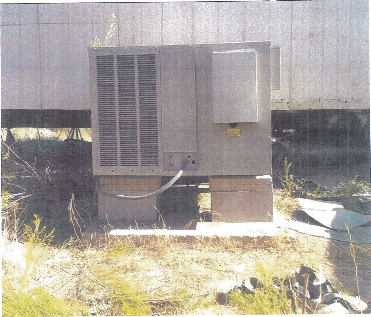
ADDITIONAL PHOTO OF A/C PAD ON SOUTH SIDE