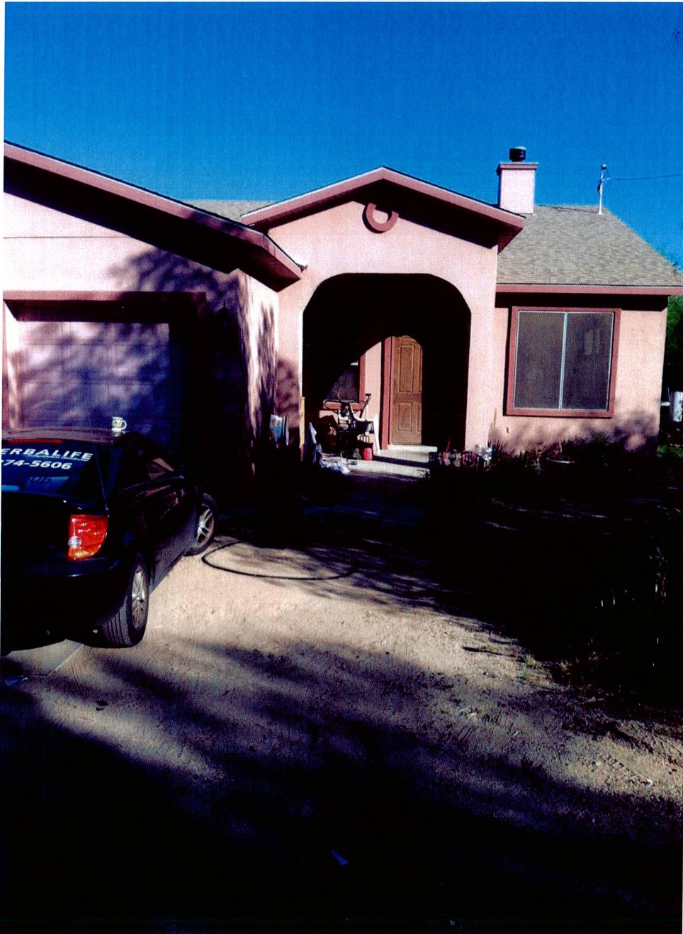
04-06-13 Front View

If using the Elevation Certificate to obtain NFIP flood insurance, affix at least 2 building photographs below according to the instructions for Item A6. Identify all photographs with date taken; "Front View" and "Rear View"; and, if required, "Right Side View" and "Left Side View." When applicable, photographs must show the foundation with representative examples of the flood openings or vents, as indicated in Section A8. If submitting more photographs than will fit on this page, use the Continuation Page.