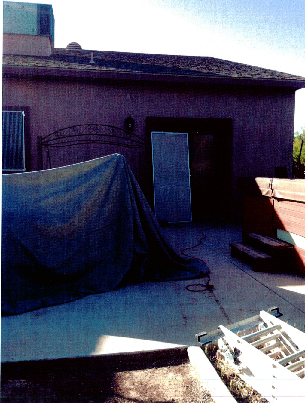
04-06-13 Rear View

If submitting more photographs than will fit on the preceding page, affix the additional photographs below. Identify all photographs with: date taken; "Front View" and "Rear View"; and, if required, "Right Side View" and "Left Side View." When applicable, photographs must show the foundation with representative examples of the flood openings or vents, as indicated in Section A8.